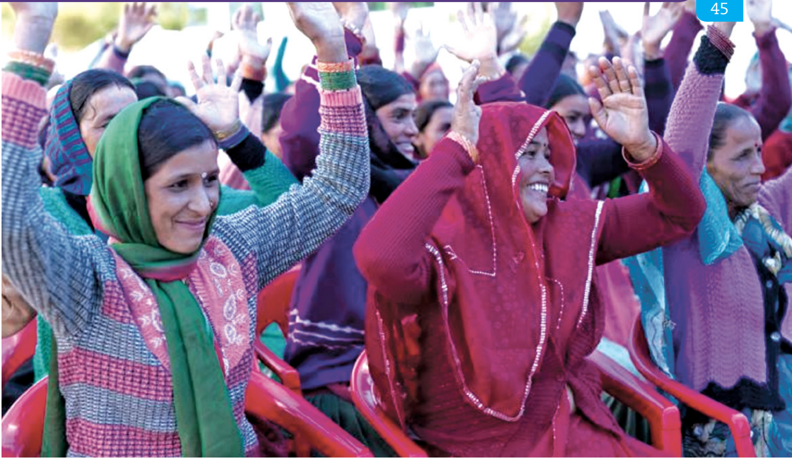
Hindu women at the Triyuginarayan Centre, India.