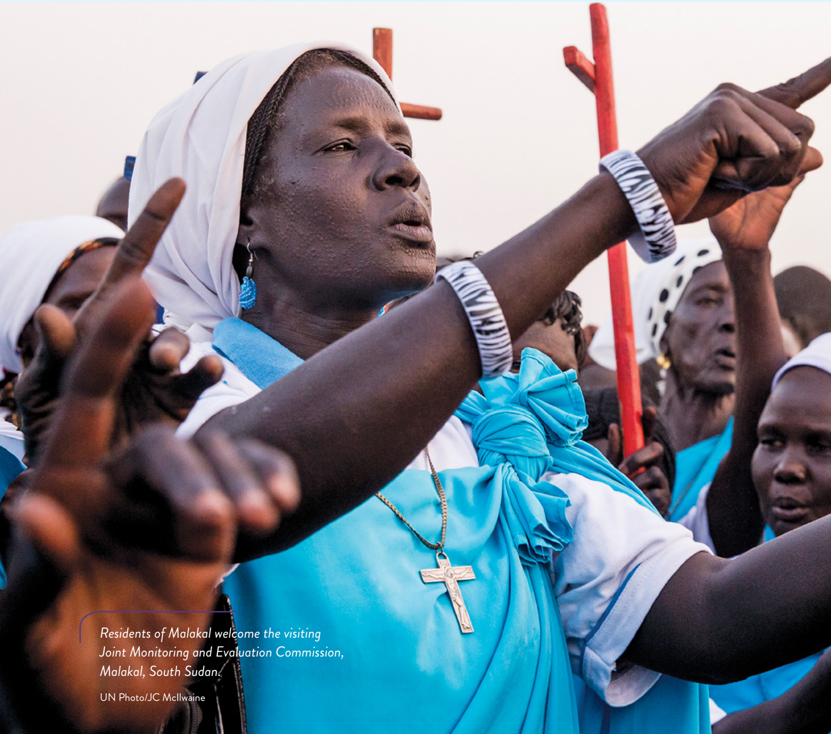
Residents of Malakal welcome the visiting Joint Monitoring and Evaluation Commission, Malakal, South Sudan.