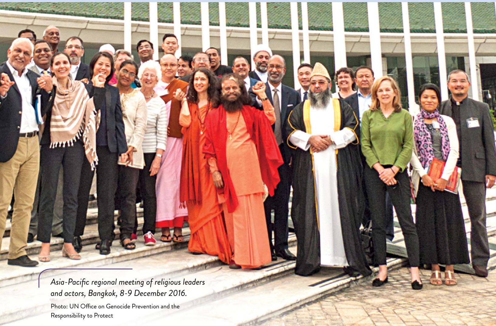
Asia-Pacific regional meeting of religious leaders and actors, Bangkok, 8-9 December 2016.

of religion, such as early or forced marriage and sexual slavery. Members of the network/coalition should keep each other informed about any measure taken to prevent, counter and respond to instances of incitement; initiate joint statements/responses; and coordinate actions, including through social media.