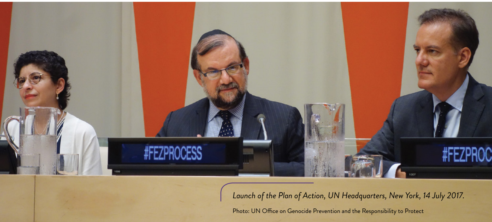
Launch of the Plan of Action, UN Headquarters, New York, 14 July 2017.