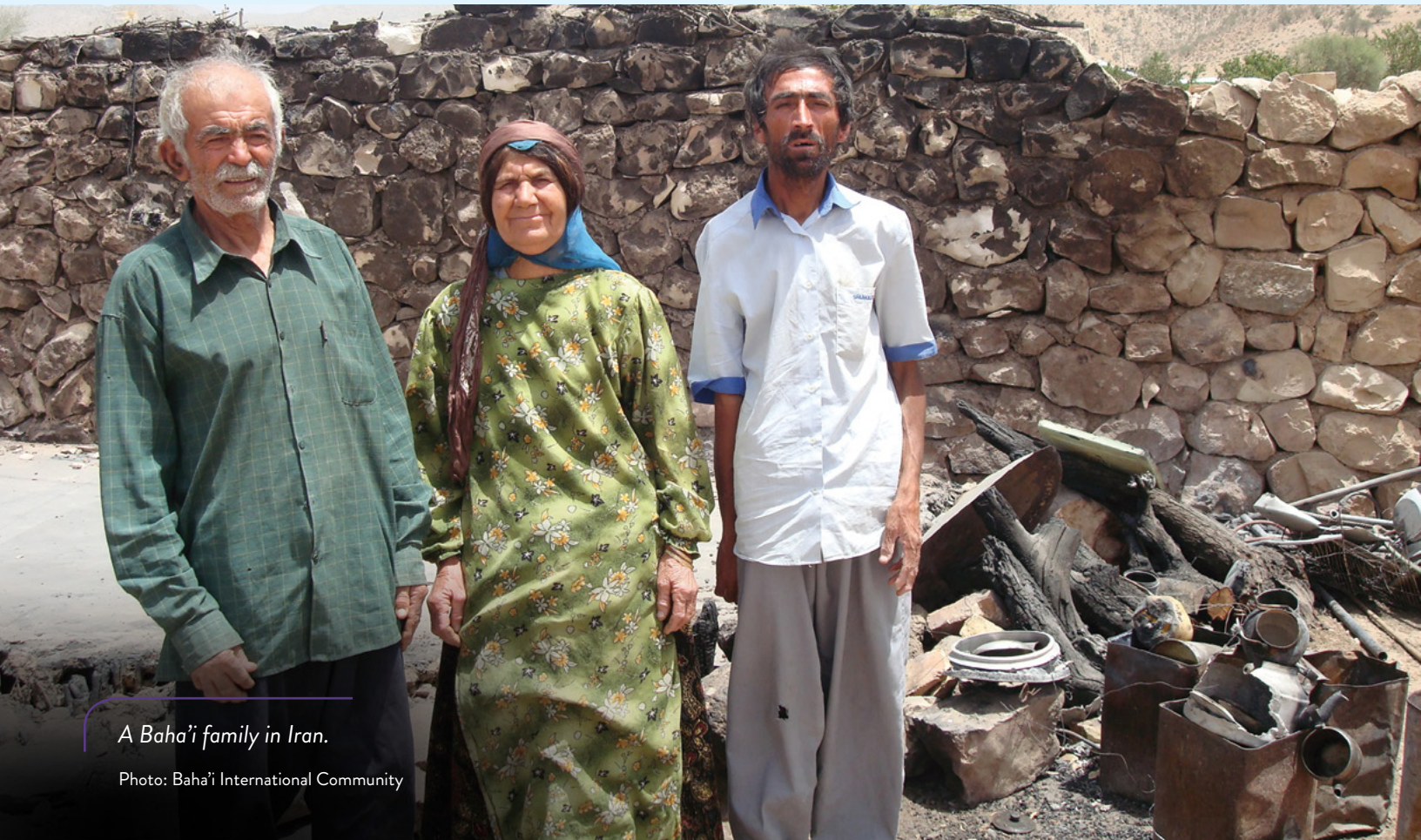
A Baha'i family in Iran.